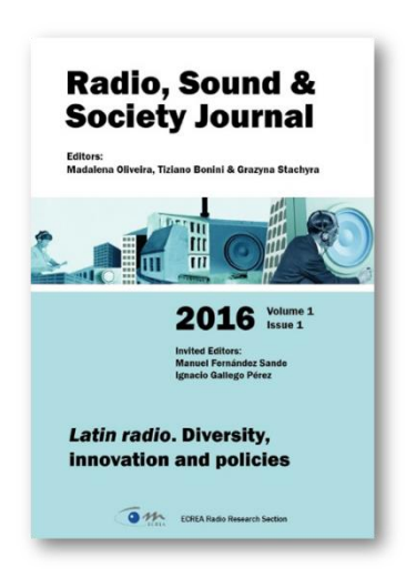
Figure 1: Vol. 1 N. 1 cover

Announced in 2015, the Radio, Sound & Society Journal (ISSN 2183-8798) was created to be an alternative scientific publication, on open access basis. The first issue on Latin Radio: Diversity, innovation and policies (Figure 1) was published in June with a selection of papers presented at the Radio Research Conference 2015 (held in Madrid).